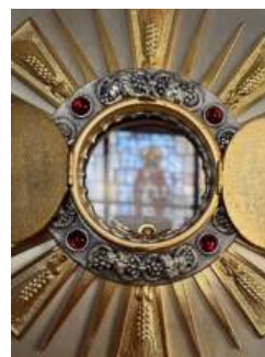
ABOVE: This picture an adorers took in our chapel while kneeling in front of Jesus, it's the reflection from the stained glass window showing up on the Host.

LOOKING for some peace and quiet? I know the perfect place.