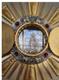
ABOVE: This picture an adorer took in our chapel while kneeling in front of Jesus, it's the reflection from the stained glass window showing up on the Host.

LOOKING for some peace and quiet? I know the perfect place.